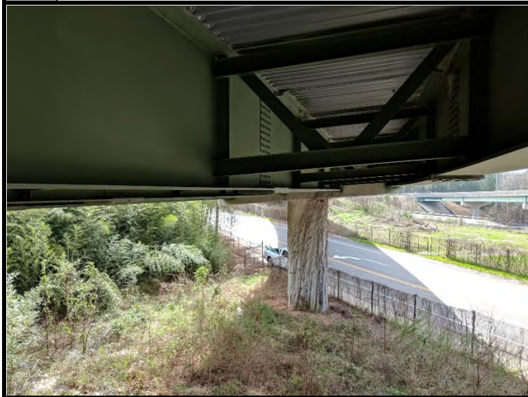
3 View of the underside of the bridge. Shows steel beams, metal decking and concrete piers.