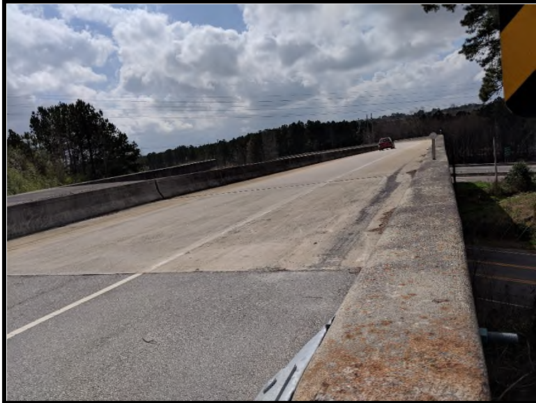
1 View of the Colonial Life Westbound over Gracern.