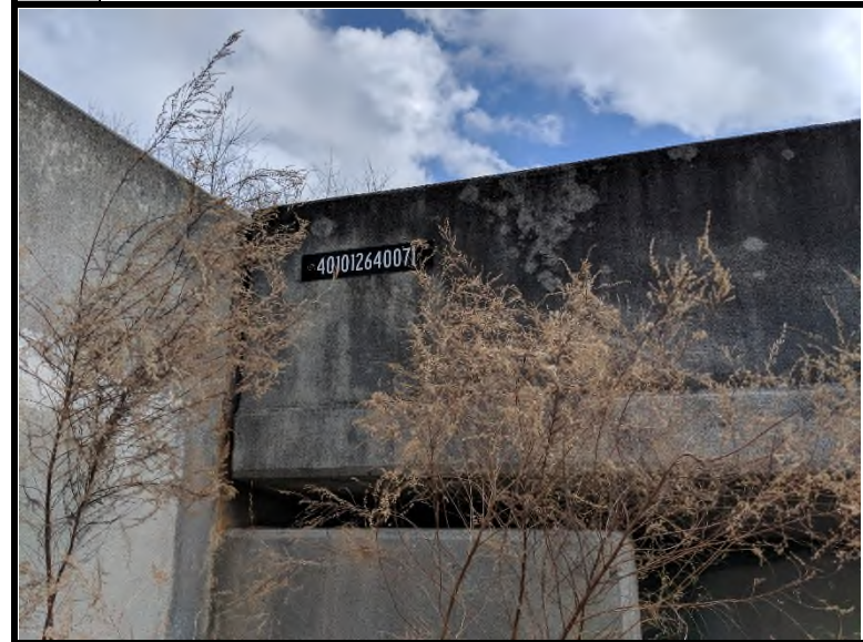
4 Textured coating located on retaining wall tested negative for asbestos via PLM analysis.