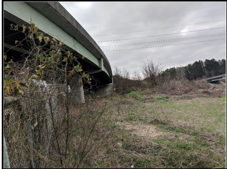
6 No scuppers were observed during the assessment of the bridge.