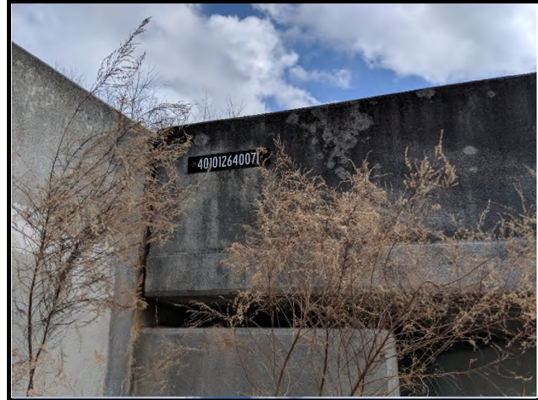
2 The bridge is identified as structure # 401012640071.