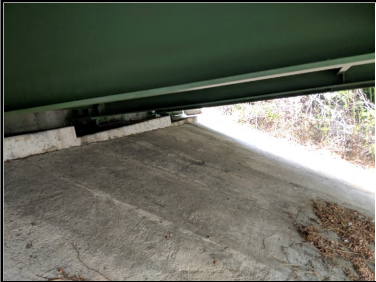
5 Expansion joint located on concrete retaining wall and the joint at the slope and foot tested negative for asbestos via PLM and TEM analysis.